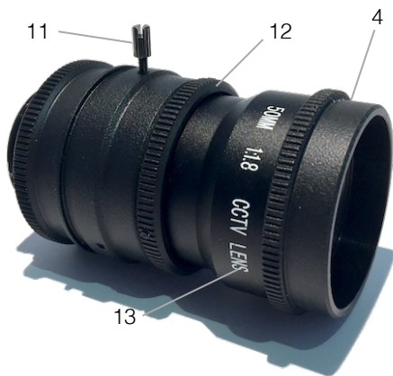
Figure 2. Lens F1.8/50mm