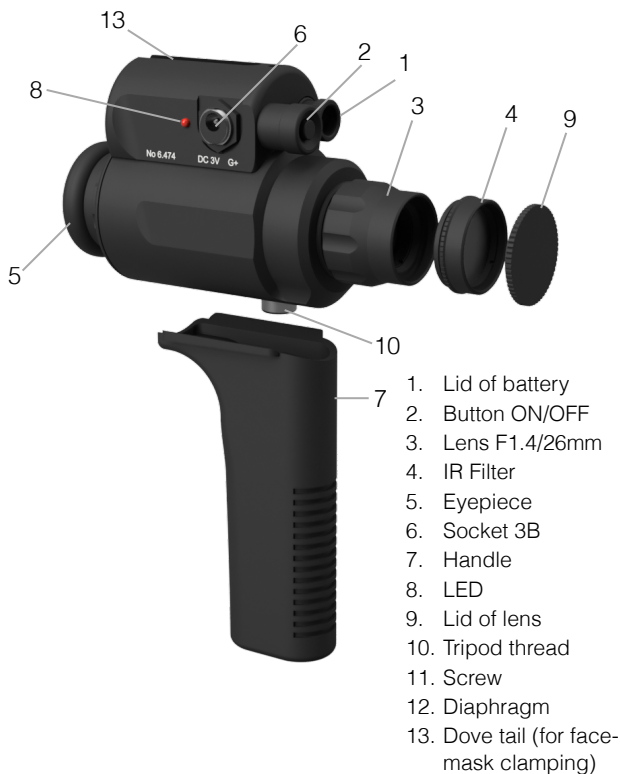
Figure 1. ABRIS M viewer