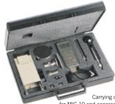
Carrying case for MIC 10 and accessories