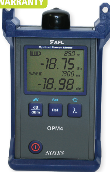
OPM4 Optical Power Meter