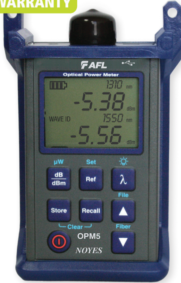
OPM5 Optical Power Meter